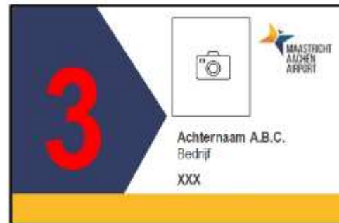
Badge with access to demarcated area (number 3) and permission to remain on airside during emergencies (red colour of the number)