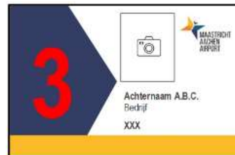
Badge with access to demarcated area (number 3) and permission to remain on airside during emergencies (red colour of the number)